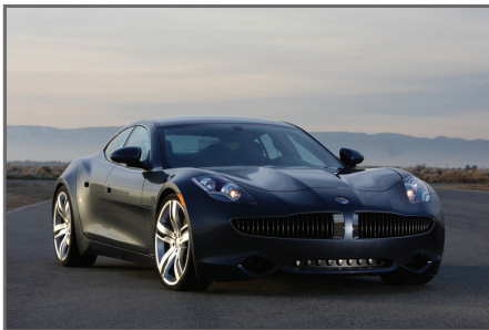
PHEV and EV Passenger Vehicles