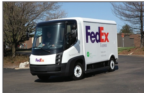
PHEV and EV Commercial Vehicles